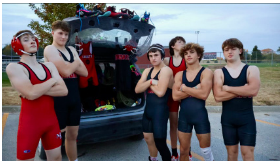
Wrestlemania The wrestling team proudly stand outside their trunk. Other sports like football and soccer also hosted trunks.