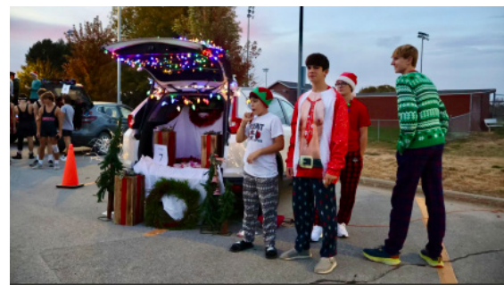
Christmas Came Early ‘Twas the first night of Halloween week but this trunk made the Christmas spirit felt by all. The trunk finished in first place, making them the trunk-or-treat champions.