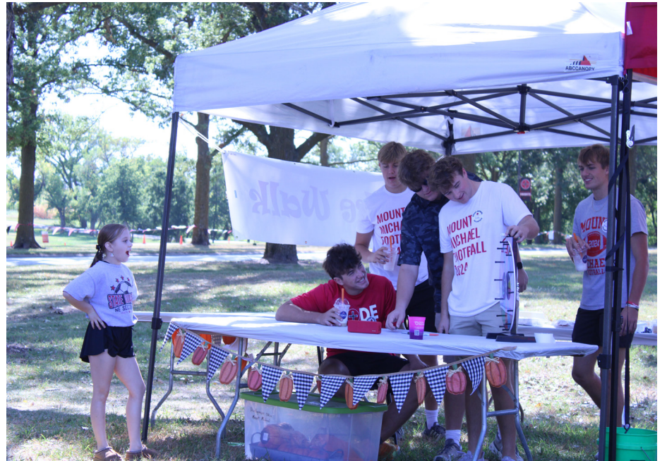
Rooted In Service Spirit is shown through the Benedictine value of service. Students are eager to volunteer during community events like the Fall Festival cake walk.

Due to the small student population, every student will know practically every name of every student. This leads to interactions between underclassmen and older students not seen in other schools. Every student is included and expected to support their classmates, leading to an unmatched level of school spirit and unity.