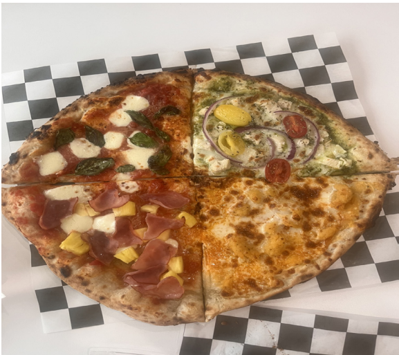
(Top left) Margarita, (bottom left) Hawaiian, (top right) Buffalo, (bottom right) Meat Lovers

Pesto: The theme of quality toppings continues with the pesto slice. The creamy pesto and fresh vegetables meshed great to make a delectable slice. 8.7